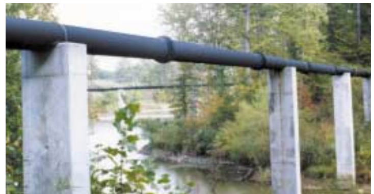
A typical MECH-LOK rigid restrained (long span) pipe design.