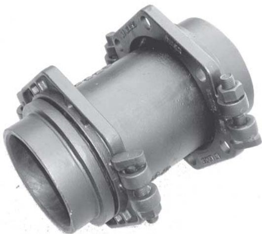
Swivel x Swivel Adapter with Glands