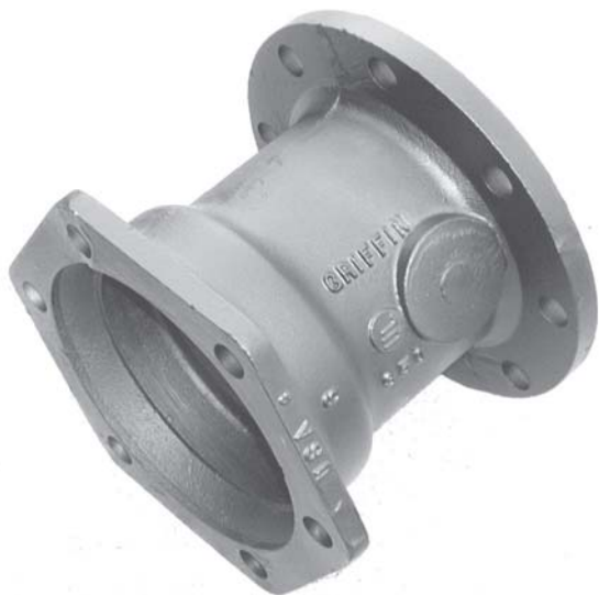
MJ x Flange Adapter